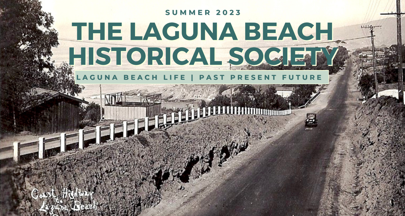
Summer Drive along Coast Highway