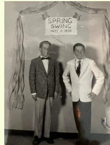
The Women's Club: Dance lessons playing near his treehouse at the Junior High School, 1956