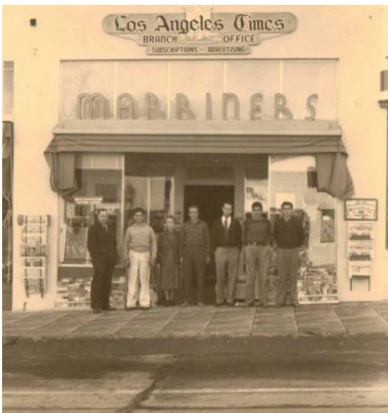
Postcard Image below:

Marriner's was the branch office for the Los Angeles Times, showing the storefront on the Coast Highway