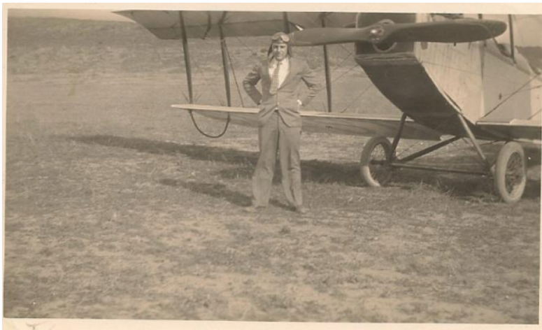
Photograph: to the left: