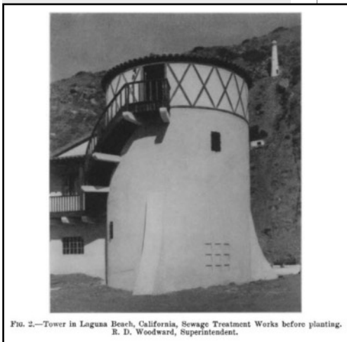
FIG. 2.—Tower in Laguna Beach, California, Sewage Treatment Works before planting. R. D. Woodward, Superintendent.

Photograph bottom left: The Digester building as it stands today.