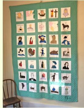
Quilt donated made by Laguna Beach 5th Graders in 1937