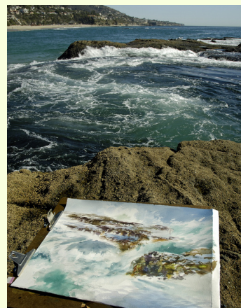
A Solomon watercolor in progress