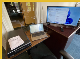
Archive Work Space updated