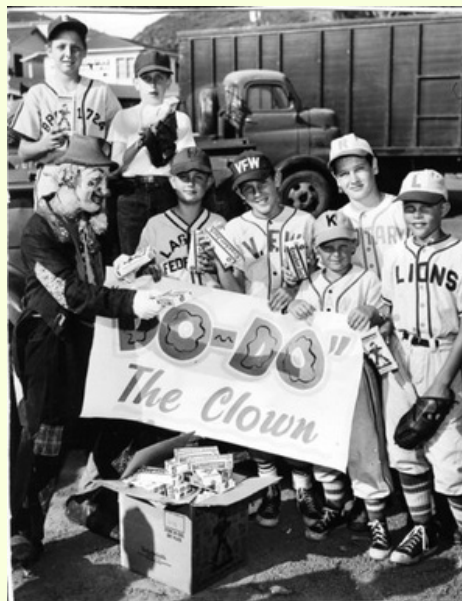
Cracker Jacks will be handed out to guests who attend the program on May 17th