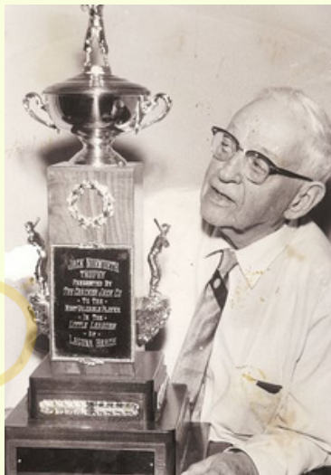
Jack Norworth , Laguna resident and writer of the song: "Take me out to the Ball Game" with Little League trophy

Tuesday, May 17th Susi Q Community Center 7:00-9:00 pm