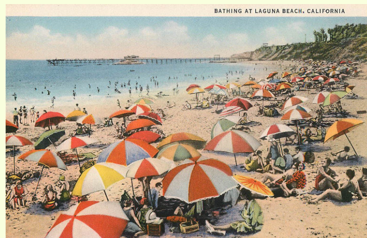
Bathing at Laguna Beach

To see some of the fruits of our labor of our all-volunteer organization, peruse our website at lagunabeachhistory.org to see past newsletters, videos of our programs, photos, and other information about the history of Laguna Beach. With your support, we hope to continue and expand these efforts for many years to come.