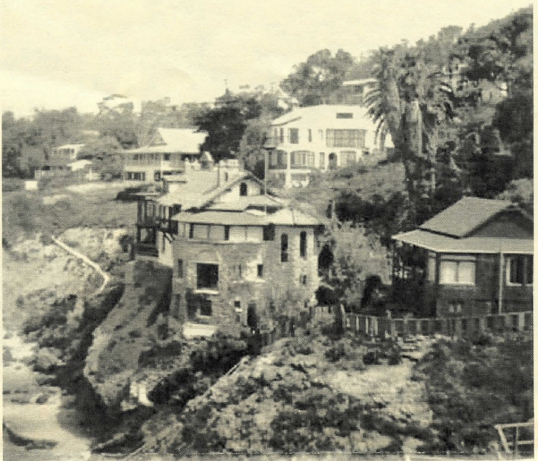
An early picture of the house and area surrounding.

More recently the representatives of the National Park Services, who investigated the estate for inclusion in the National Registry of Historic Places, described Villa Rockledge as "a two story complex of Mediterranean influences, with rustic stone towers, large open porches on the ocean side, ornamental chimneys, and casement windows." They further stated: "The interior of Rockledge nearly defied verbal description...Miller's imagination